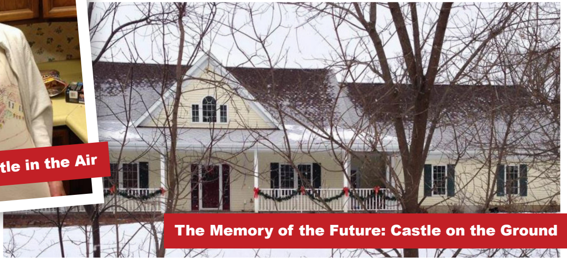
The Memory of the Future: Castle on the Ground

“If you have built castles in the air, your work need not be lost; that is where they should be. Now put the foundations under them.”