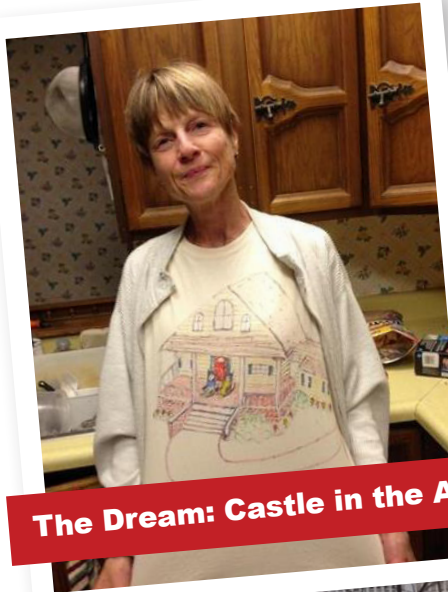
The Dream: Castle in the Air

One of the many Memories of the Future that have become Realities of the Present