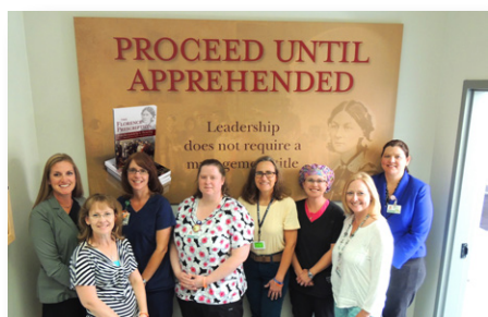
In a culture of ownership everyone is a leader!

There is a wealth of free resources available at TheFlorenceChallenge.com to help you optimize the impact of this book, including: